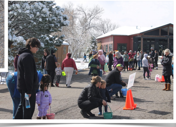
Here are some pics of happy kids (and a happy bunny).